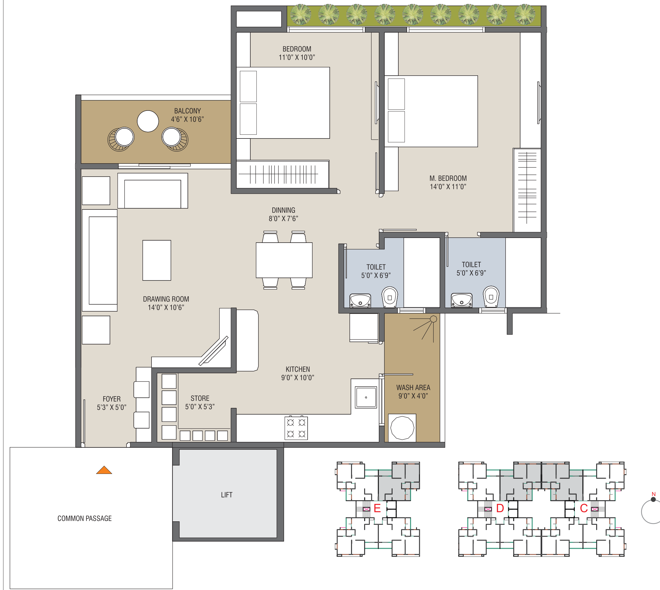
2 BHK TYPICAL UNIT PLAN