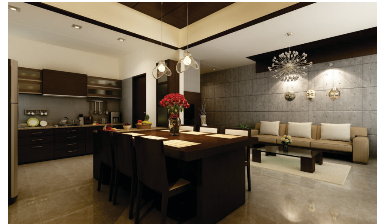
Ultra luxury apartments.... atulyam.... a dream destination where you find your world.